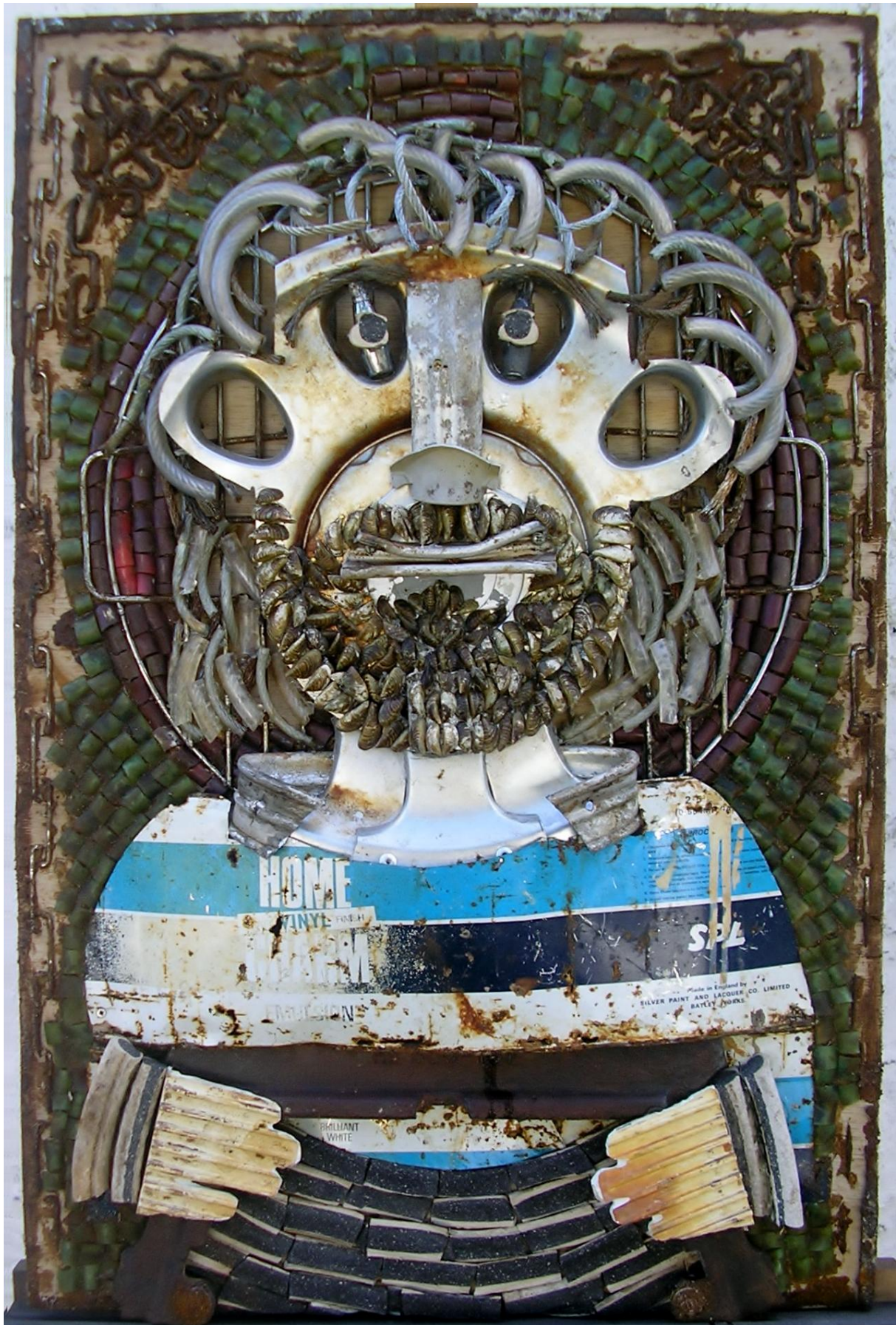
1. THE BOOK OF EGLINTON COVER