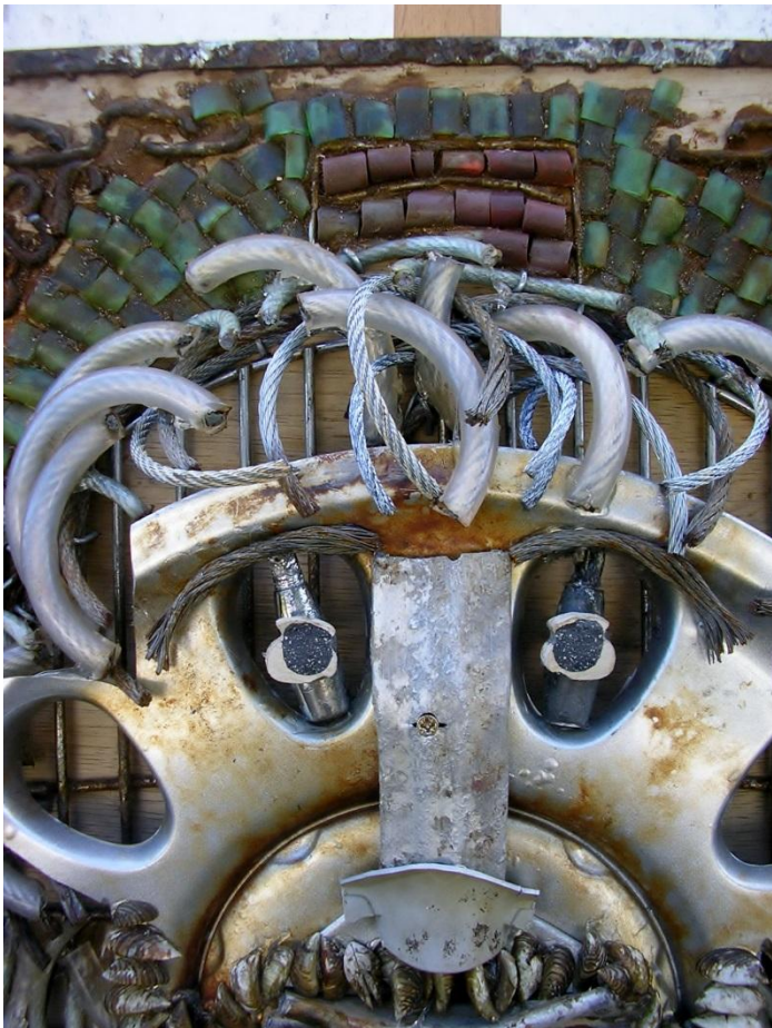
4. DETAIL showing plastic coating from bicycle lock chains as mosaic, also wire as hair, BBQ grill as halo, hubcap as face, locks and rubber wheel as eyes.