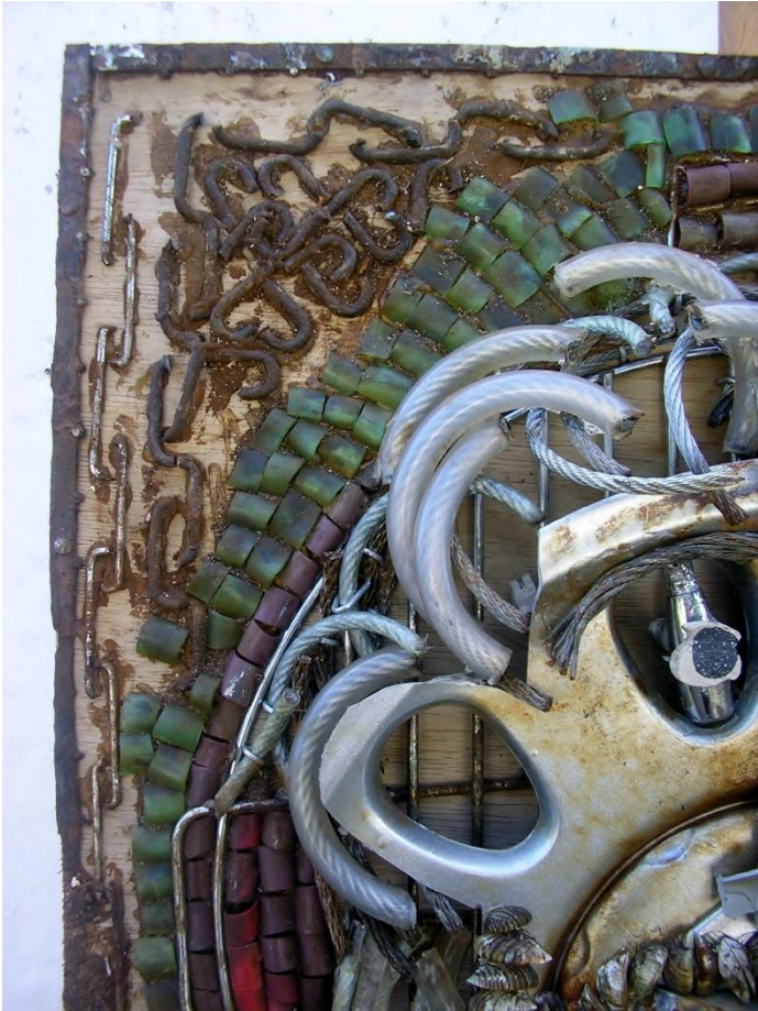
3 DETAIL showing bicycle chains, the metal and plastic being used to represent Celtic interlacing work, mosaic and hair.