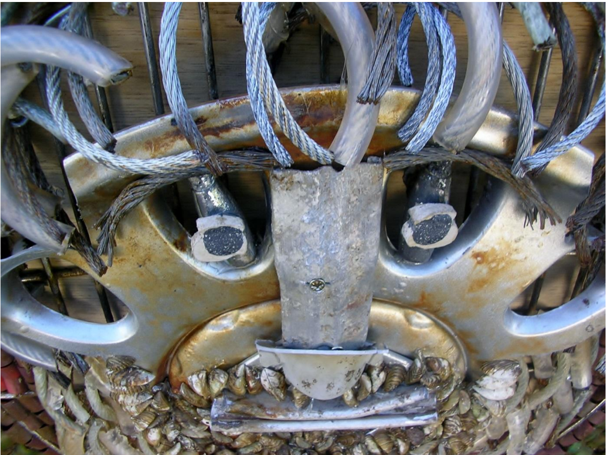
10. TOP VIEW