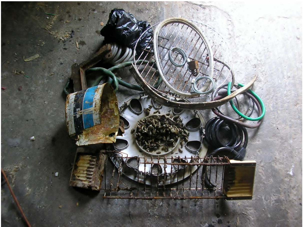
2. ORIGINAL FOUND OBJECTS