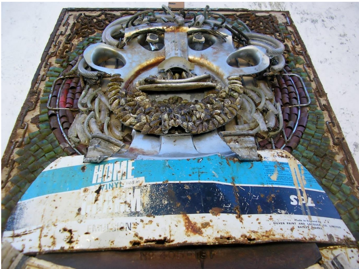
11. BOTTOM VIEW.