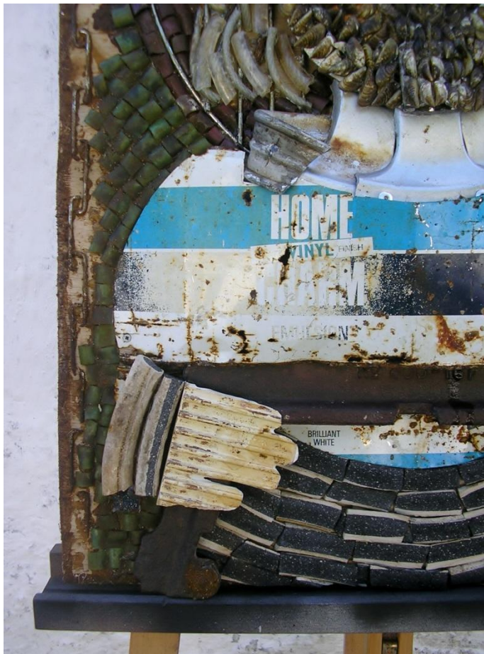
6. DETAIL showing bathtub tray as hand and wire as edge decoration, rubber tyre as sleeve and sliced for garment, cast iron as object being held in the hands.